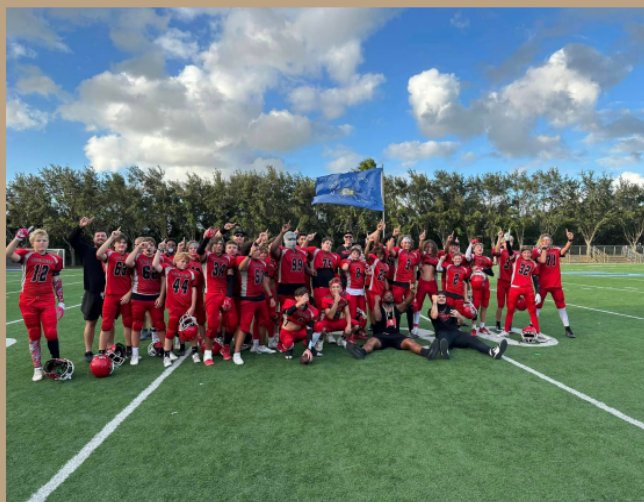
Horace O'Bryant School football team claimed the Tri-County Championship in a tough game against Somerset Academy. Congratulations on an outstanding season!